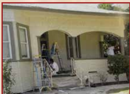
GARDEN house before renovations

Nearly everyone that is reading this has probably had to say goodbye to certain things this year: maybe it is a certain way you used to do things, you moved to a new place, lost a loved one, or changed the way you work. It was sometimes without warning and we did not get a chance to say a proper goodbye. Or we may have had warning but didn't get the opportunity to celebrate this person due to many restrictions. We are no different. We have also had to say goodbye to many things and people we have loved.