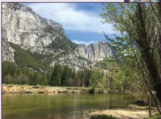
Easy day: Here is our beautiful view while enjoying lunch on the easy day!