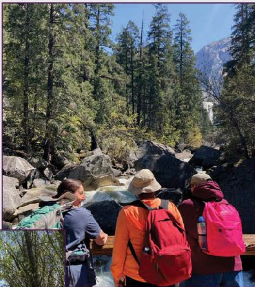
Hard day: Halfway to the top, we stopped to take in the sights and reflect on the journey ahead.

The ladies that went on that day knew how to be still. We sat by the river for four hours and they would have stayed longer if we didn't have to get back. It is a great reminder how important God's creation is to the healing process. He is made known through His creation. When we can be still before Him, He speaks and His words heal.