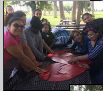
"Broken heart" puzzle task provided a creative way of emphasizing and encouraging trust in each other.